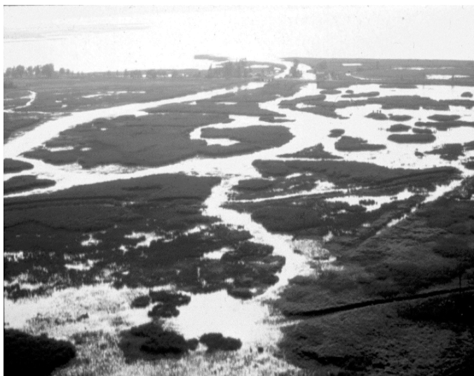
Big Creek Marsh, Long Point Wetlands Complex